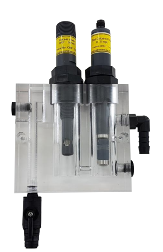
ORP2 sensor in a double open flow cell alongside a total chlorine probe