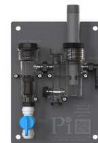
Single flow cell (open or closed)