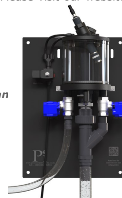
DioSense in an AutoFlush flow cell

The DioSense can be installed in a variety of auxiliary flow cells and self-cleaning devices. Please visit our website or refer to our ISB36 AutoFlush brochure.