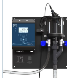
Single or double sensor Autoflush