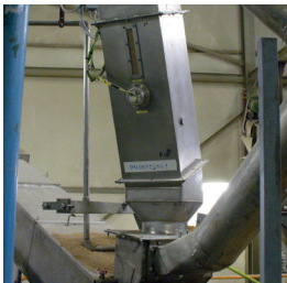
Wheat / Corn