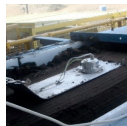
Coal & coke iron ore