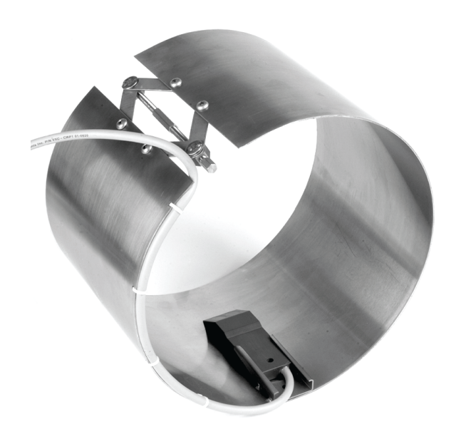
Band Adjustment Jack