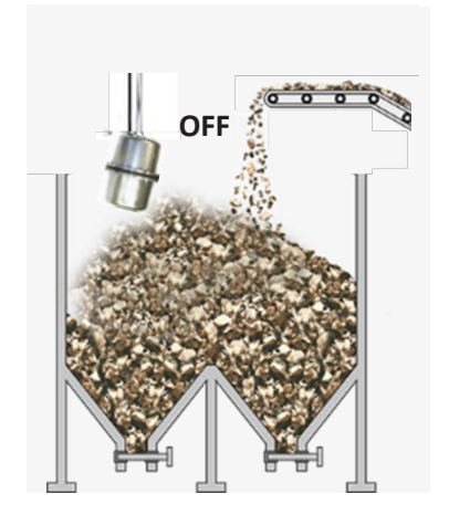
When the high level is reached, the level sensor tilts and stops filling the silo