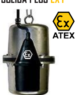
Metal cage + SOLIBA EX P For use only in hazardous areas classified 21,22