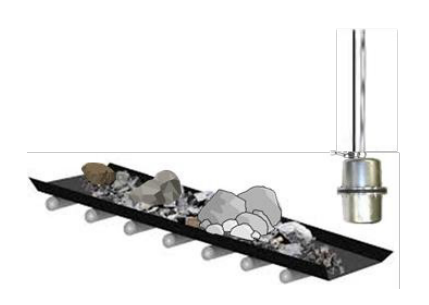
When bulk solids are conveyed by belt conveyors, the SOLIBA PLUS is suspended vertically.