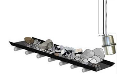
When an object is too big (or oversized), the level sensor tilts and stops the conveyor