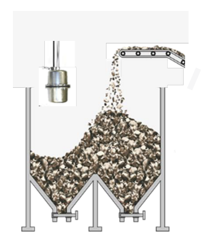
When the silo fills up, the level sensor is suspended vertically.